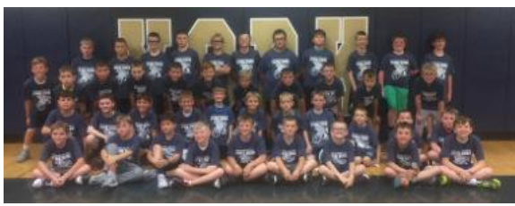
2019 4 th -6 th Campers