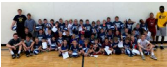
2019 1 st -3 rd Campers